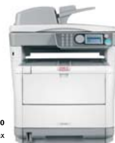
MC360 Print, copy, scan, fax