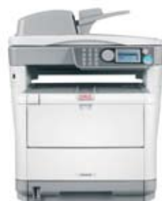
MC350 Print, copy, scan