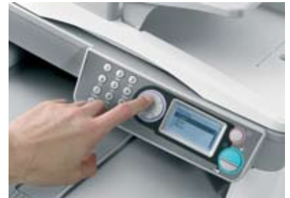
Inviting and easy to use operator panel

The highly dependable single-pass digital LED technology and straight paper path deliver superior reliability and performance that your business can rely on.